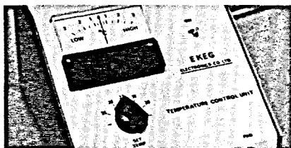
TEMPERATURE CONTROL UNIT

EKEG Electronics has developed a line of monitoring equipment for veterinary surgery and animal research. Among these products is our Temperature Control Unit, selling for $750. This is battery operated, uses continuous control with no switching transients and was designed for neurophysiological research. It will accurately maintain the temperature of an animal at the normal physiological or other chosen temperature during anaesthesia.