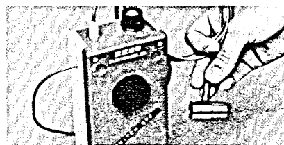
VETERINARY RESPIRATION MONITOR

A number of Respiration Monitors are available, the most popular being the veterinary model, which is small and very easy to operate. It gives an audible signal with each breath, enabling the surgeon to concentrate on his work while having a continuous monitor of the animal's depth of anaesthesia. This model comes with a choice of sensor for $325.