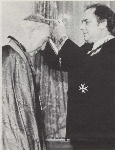
Cardinal Carter receives his insignia from Governor General Schreyer.

Toronto novelist Morley Callaghan published his first novel Strange Fugitive in 1928 and has since written a number of other books including: A Broken Journey , Such Is My Beloved , More Joy in Heaven , The Many Coloured Coat and A Fine and Private Place . In addition to several plays, Mr. Callaghan has published more than 100 short stories in North America and Europe. He has received a