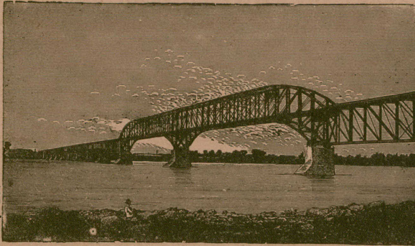
ST. LAWRENCE RIVER BRIDGE, CANADIAN PACIFIC RAILWAY, LACHINE, P. Q.

For Railways and Highways, Iron Bridges, Turntables Iron Piers and Trestles Bridge Rods Right and Left Hand Sleeve Nuts and all kinds of Structural Iron Work.