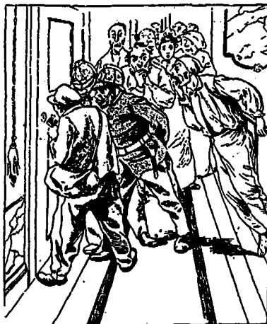
THE ALARM OF "BURGLARS!"

CROWN PERFUMERY CO. 177 New Bond Street, London, Eng.