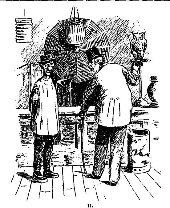
CUSTOMER-"" No, not nowl. Owl-you fool 1" HOP SING-" Allee light, yeh-owlyoufool-ych."

TOM-" Then she must be younger than she looks."