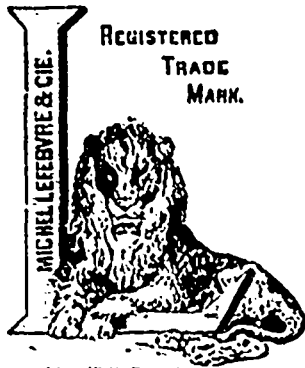
Lion "L" Brand.

... 20 First Prizes, Gold, Silver and Bronze Medals.