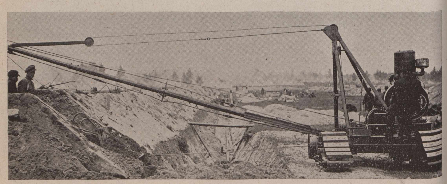
Austin Backfiller at Work on Sewer Trenches.

Well A produced 166 gallons per minute, well C 800 gallons, and well D 500, or a total from all three of 2,111,040 gallons per 24 hours and all within an area of between two and three acres. The amount of water required for the camp was estimated at 20 gallons per