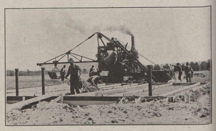
Steam-driven Concrete Mixer, with Boom and Bucket, Working on Latrines.

There two wells (say, A and B) were drilled 1,500 ft. apart, each to a depth of 180 ft. Well A yielded 244 gallons per minute continuous flow. The next day 700 gallons per minute was obtained from well B, but the flow