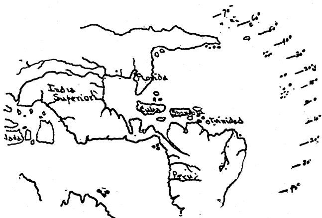
SLOANE MANUSCRIPTS, 1530.