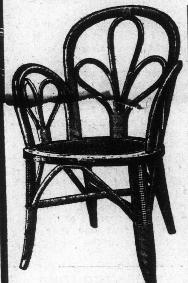
REED CHAIR Same as illustration, built

illustrations on this page are a few out of the many pieces in stock,