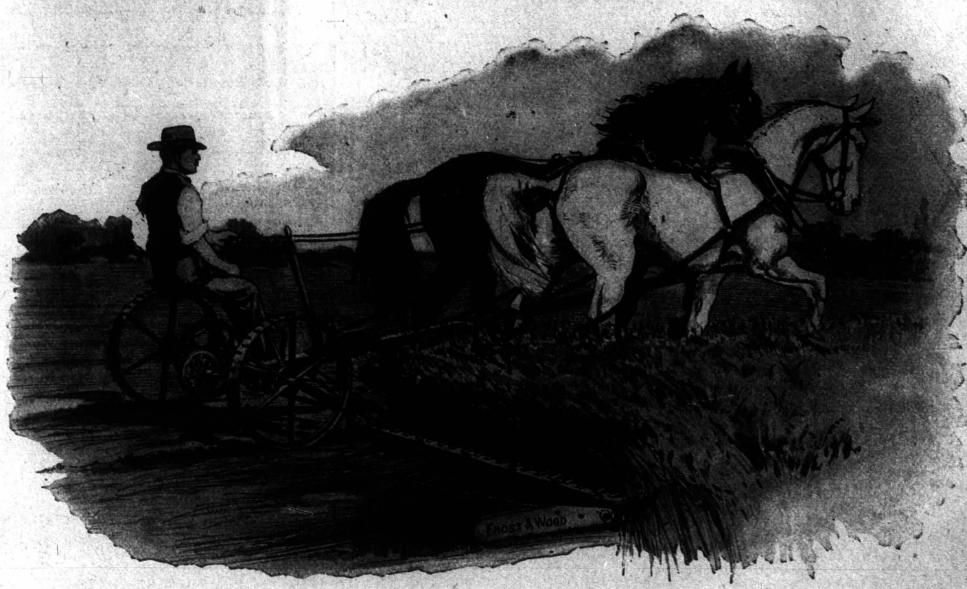
4%, 5 AND 6 POOT OUT.

Our No. 8 Mower will start in heavy grass without backing the team, and will cut grass any other mower can cut. Will run as easy and last as long. We sell our machines on their merits, and build our reputation on the "quality," not the quantity, of goods we make.