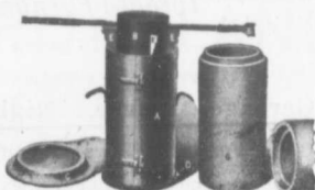
Moulds and the Tile they make.