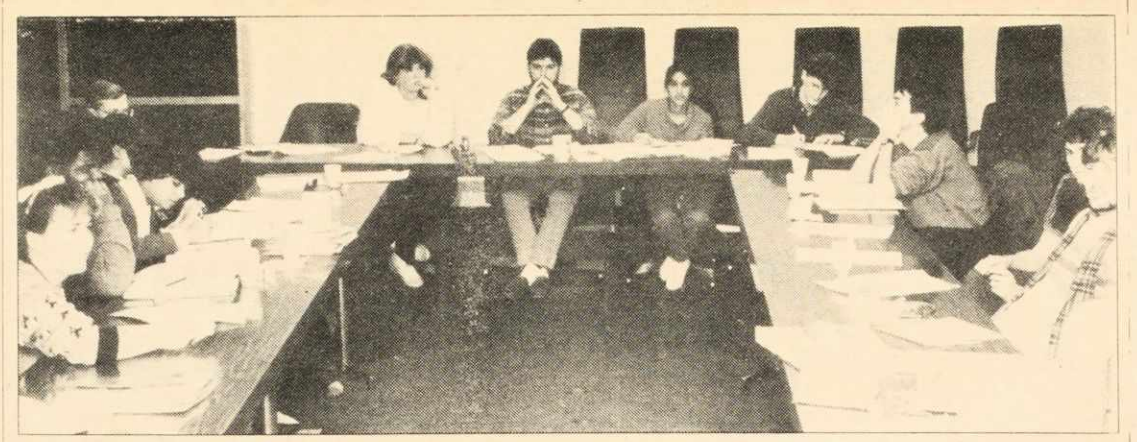
Members of the DSU council fill out their resumes during a quiet moment in debate.