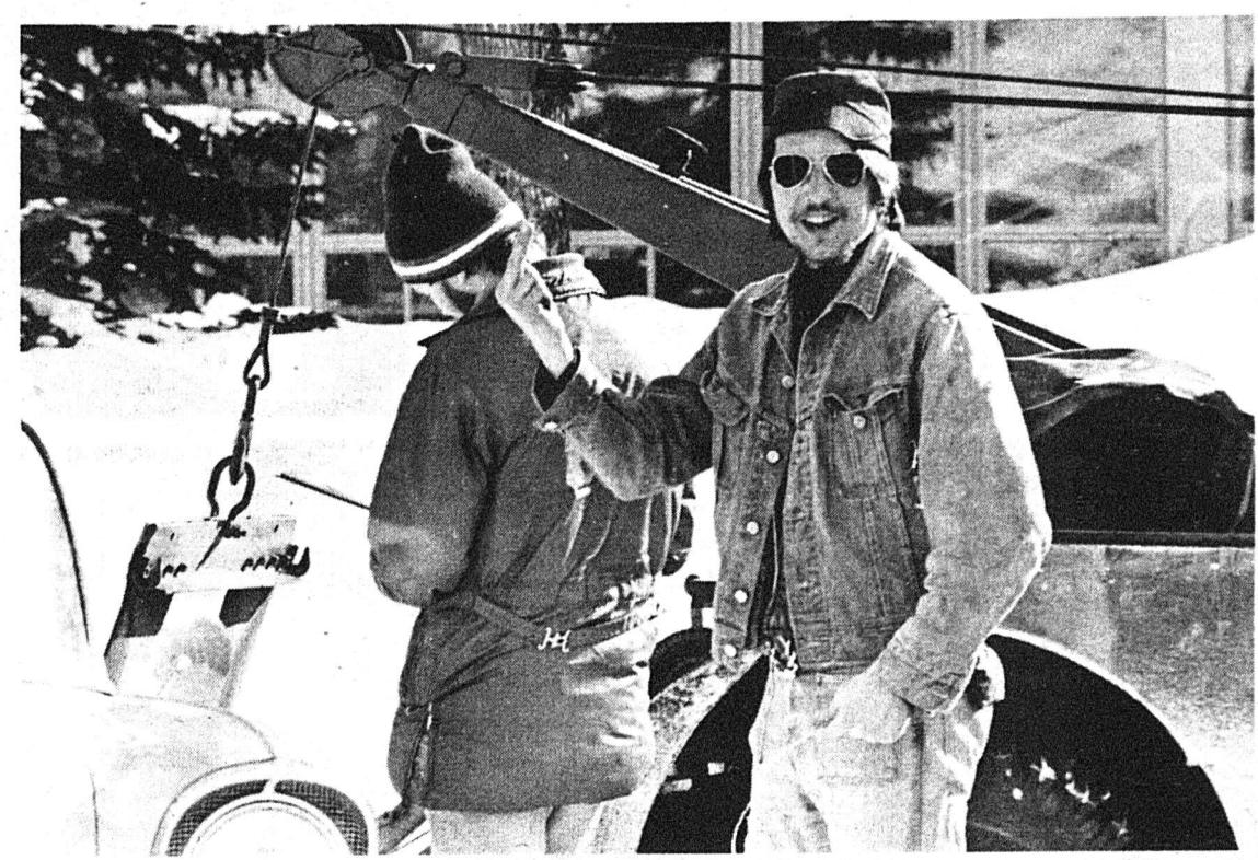
He's a drugstore truck drivin' man

along with student representatives to General