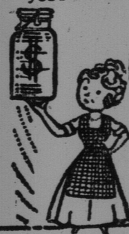
Illustration by courtesy of National War Garden Commission, Washington.

Putting fruit and vegetables in a jar at this time of year is just like putting dollars in the bank. It spells economy and conservation and during the winter months, when we will be asked to save butter for overseas shipment, the foresighted women will rejoice over the good investment they made when the fruit season was on.