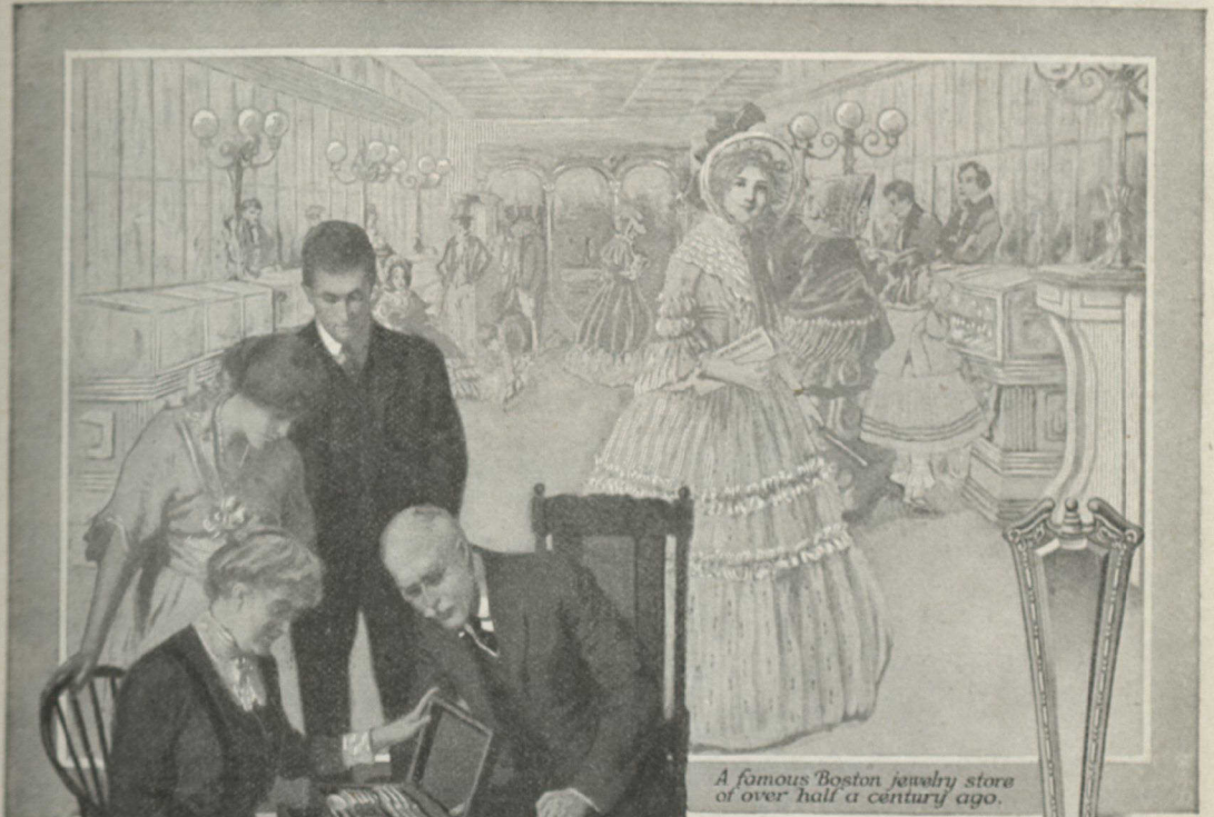
A famous Boston jewelry store of over half a century ago.

"That's the make of silver-plate that we received when we were married, and we still have some that was mother's"