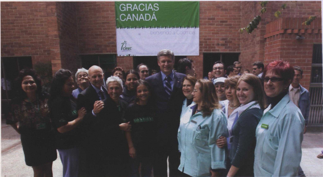
Prime Minister Stephen Harper at the Colombian Integral Rehabilitation Centre in Bogota, Colombia, during his visit to Latin America and the Caribbean in July 2007