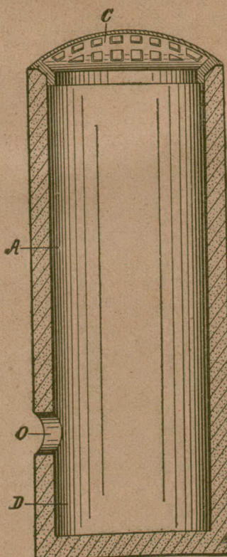
Description of No. 1.

SPECIAL SIZES FOR SPECIAL WORK MADE TO ORDER.