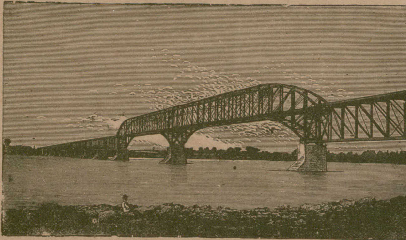
ST. LAWRENCE RIVER BRIDGE, CANADIAN PACIFIC RAILWAY, LACHINE, P. Q.

For Railways and Highways, Iron Bridges, Turntables Iron Piers and Trestles Bridge Rods Right and Left Hand Sleeve Nuts and all kinds of Structural Iron Work.