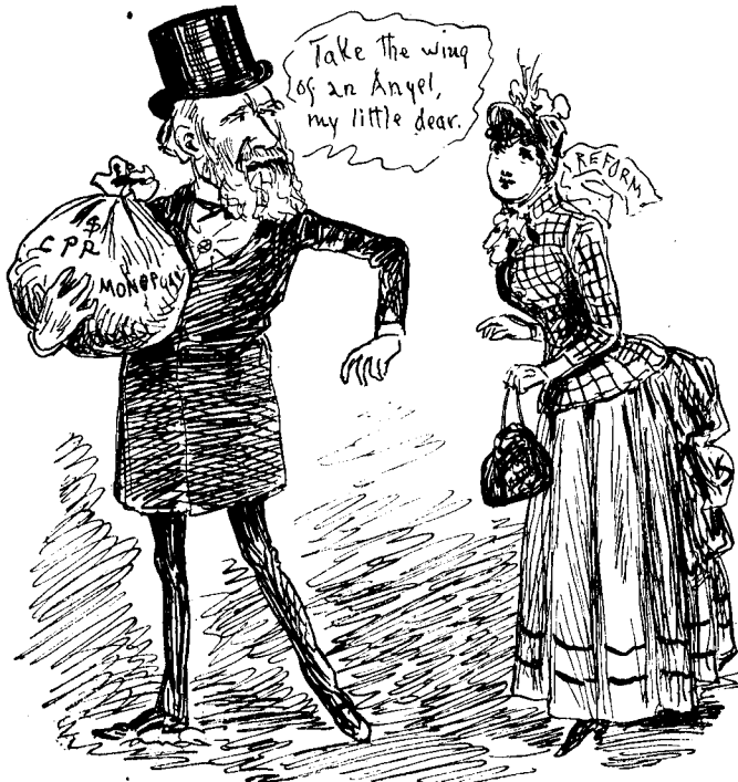
THE COY, CONSISTENT MAIDEN.

Reform Party (Winnipeg) to Sir D. A. Smith.— TAKE YOUR ARM? I DON'T LIKE TO, AS I HATE MONOPOLISTS, BUT SEEING IT'S YOU, I DON'T MIND JUST THIS ONCE.