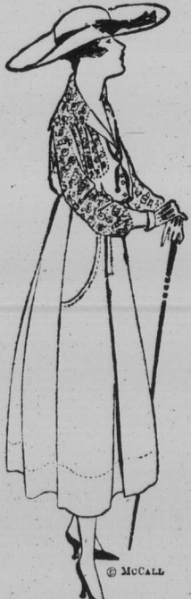
6649-7639 A New Waist and Skirt.

As for the blouses, we may witness a revival of the garden smock, which took so strong a hold a summer or so ago. One of these recently seen was quite different from the smock as we knew it last summer. It was of tango-red crepe, long and loose, and slipped on over the head. It was