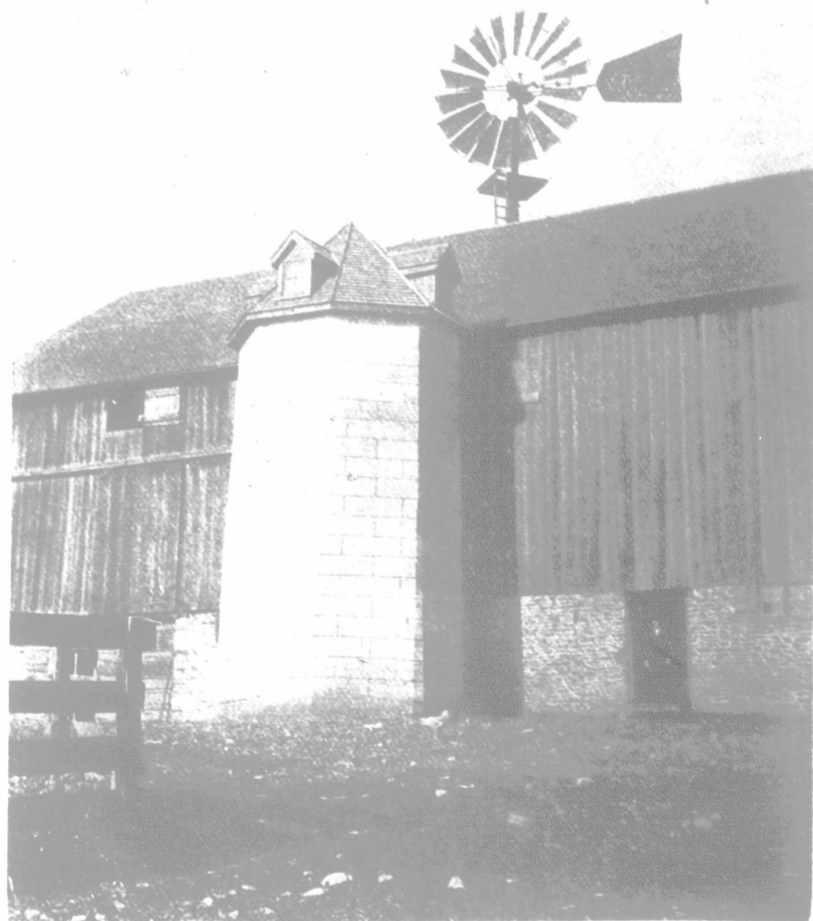
Farm of A. C. Pettit. Silo built with Battle's Thorold Cement. Dimensions 30 feet high and 12 feet in diameter. Driving-house floor 26 x 36 feet.