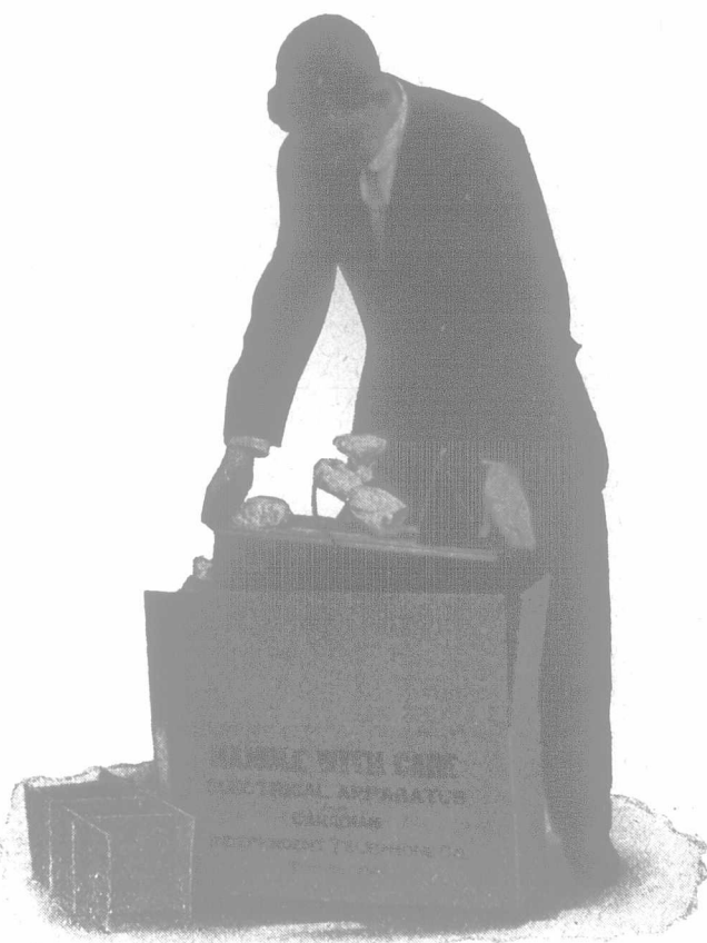
Every telephone in a separate case, ready to go on the wall.