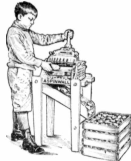
THE ASPINWALL CUTTER

The Aspinwall Cutter is a great time and labor saving machine. Six to eight bushels of seed can be cut per hour. A boy can operate it. Division of eyes is better than average hand work. Potatoes can be halved, quartered or cut to any size and the seed end removed if desired.