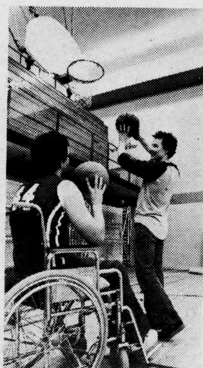
Services to handicapped