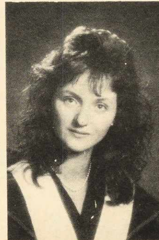
"I voted for JARVIS"