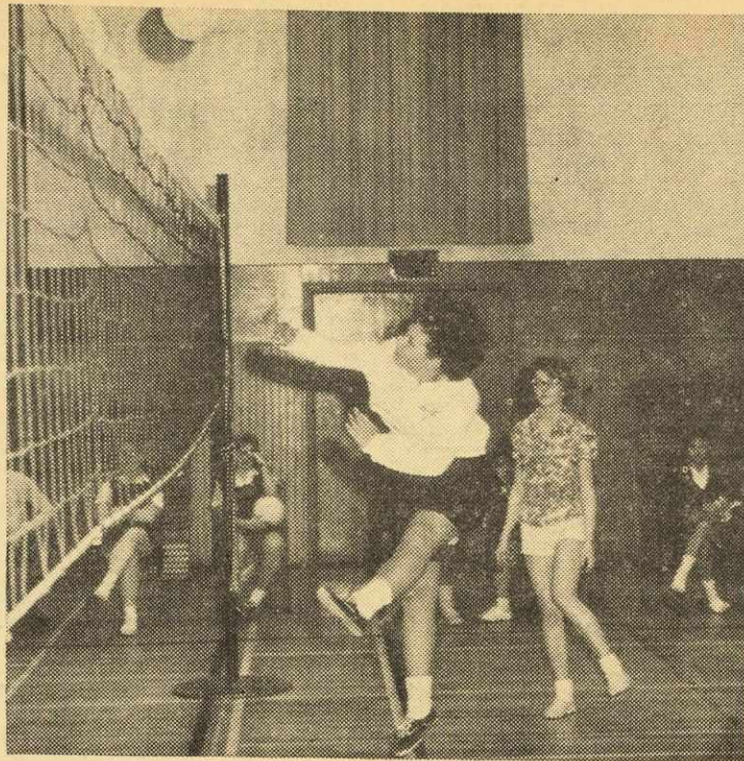
VALUE OF ATHLETICS? — In this picture, a promising Dal volleyballer releases her frustrations in convincing style with a sharp smash over the net in an exhibition game against St. Pat's.