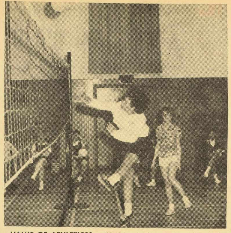
VALUE OF ATHLETICS? - In this picture, a promising Dal volleybelle releases her frustrations in convincing style with a sharp smash over the net in an exhibition game