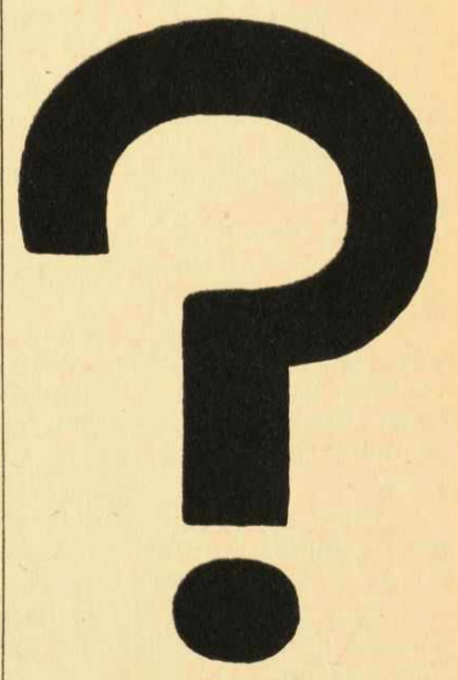
ALL TIED UP President, Delta Gamma