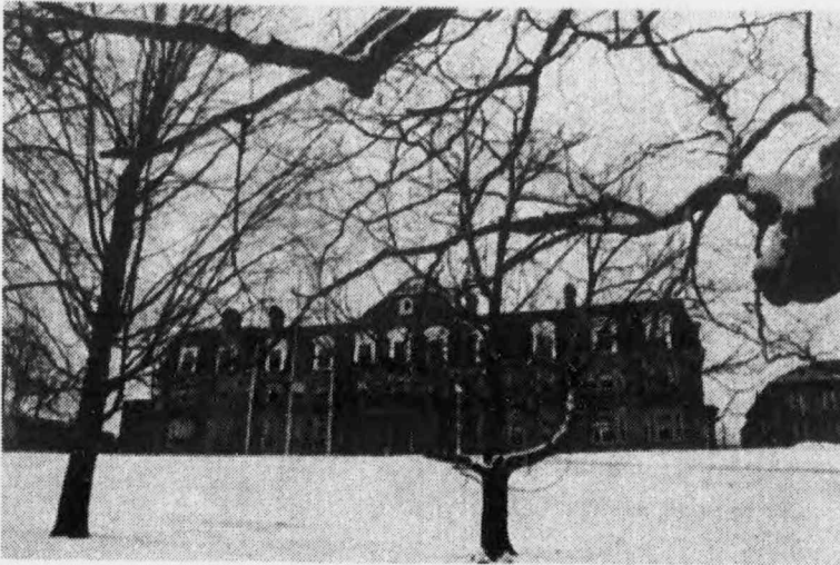
The Old Arts Building, seat of power.

committee settled on, was "an appropriate number, all things considered."