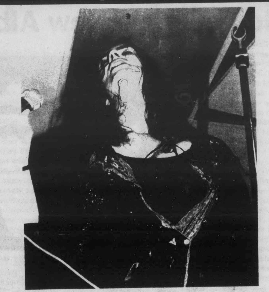
The Social rocked on Tuesday night with a raunchy show by National Velvet.