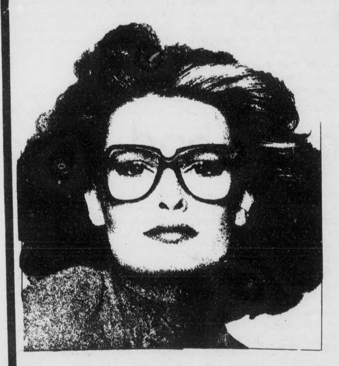
• prescription eyeglasses sunglasses