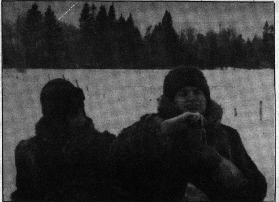
Mon Oncle Antoine was a critical success in English Canada, U.S.A. Britain and France.