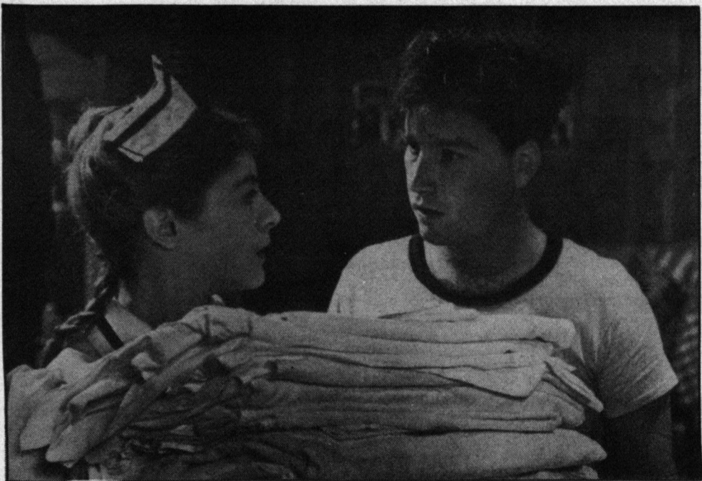
The Apprenticeship of Duddy Kravitz won 6 major awards, including The Golden Globe Award and grand prize at the Berlin Film Festival 1974.