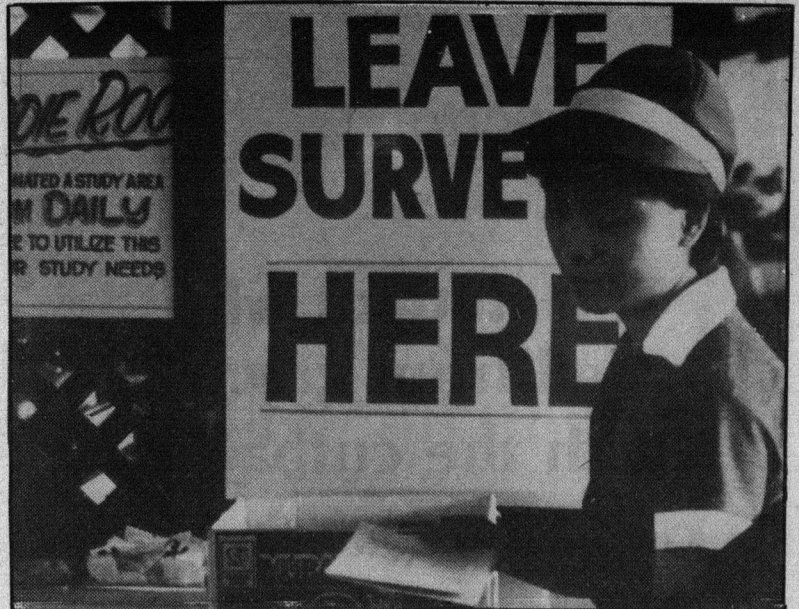
It's survey time at Housing and Food Services. The surveys, filled out by customers at cafeterias and food bars across campus all this week, will allow Housing and Food to determine what its customers think about the service. Last year's survey led to renovations in the Subway and an addition of a Mexican bar in CAB.

Another survey of 1983-84 room and board rates of residences across the country indicated that only four out of the 30 residences which offer board programs charge more for meals per student per day than does Housing and Food Services at the University of Alberta.