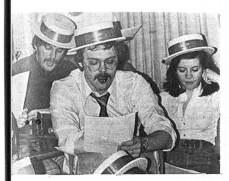
Quebecois AIESEC delegates spouting - in French.