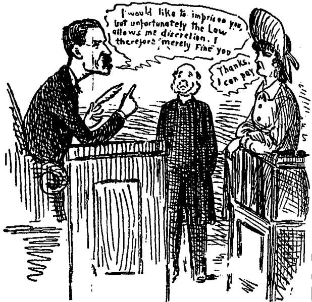
PITY THE POOR MAGISTRATE. HOW CAN HE HELP IT WHILE THE LAW ALLOWS HIM DISCRETIONARY POWERS?

The young man hesitates to say that he'll protect and guard her. It could hardly be expected when the youth is nearly froze. He'd express much loving sentiment with handkerchief to nose. Yet it's not so melancholy; what with skating and with sliding, Or taking Angelina out on moonlit nights sleigh-riding, You may pass a pleasant season if of money there's no stint, or Free from duns and "little bills" you wander through the winter.