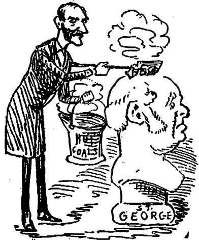
THE CHRISTIAN SKEPTIC.

The young man hesitates to say that he'll protect and guard her. It could hardly be expected when the youth is nearly froze. He'd express much loving sentiment with handkerchief to nose. Yet it's not so melancholy; what with skating and with sliding, Or taking Angelina out on moonlit nights sleigh-riding, You may pass a pleasant season if of money there's no stint, or Free from duns and "little bills" you wander through the winter.