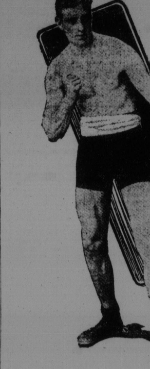
By FRED BOALT.