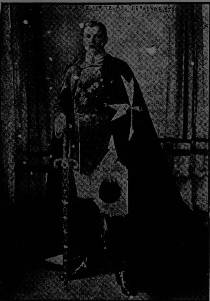
Kaiser's Son May Succeed General von Kluck.