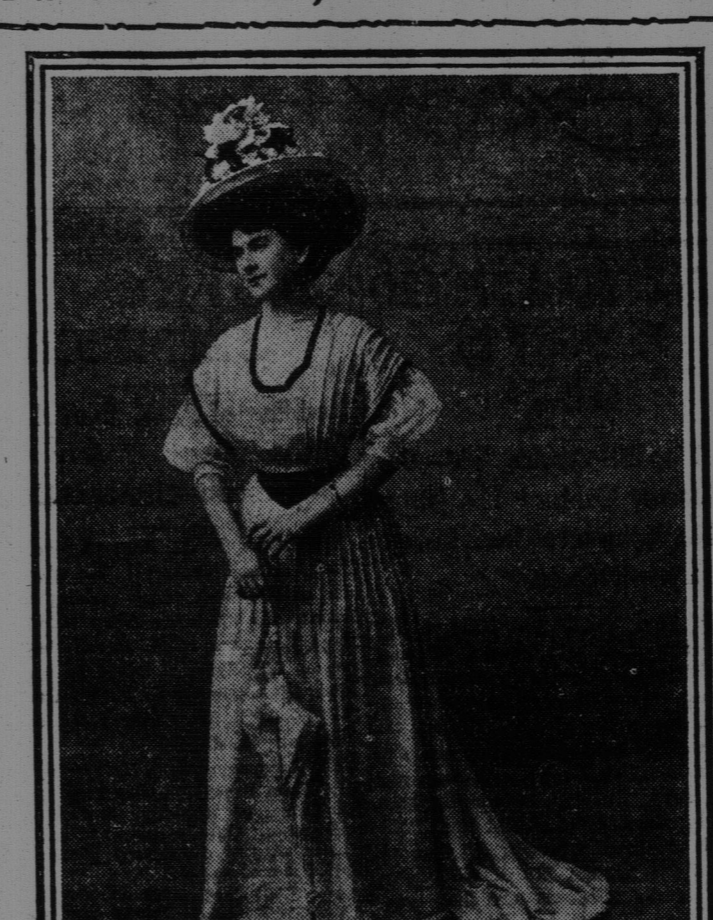
MOHAIR JUMPER FROCK FOR WARM DAYS.

Because mohair is light of weight, sheds the dust and is practically non-crushable, many women prefer it to pongee or linen as a fabric for a warm weather costume. Some of the mohair jumper frocks are exceedingly simple of design and owe much of their effectiveness to the delicateness of their finishing.