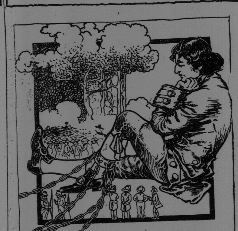
The Lilliputians drugged Gulliver and put him in chains and kept him captive. (Gulliver's Travels, by Swift.) Find another European.

ANSWER TO YESTERDAY'S PUZZLE. Upside down, against right arm.