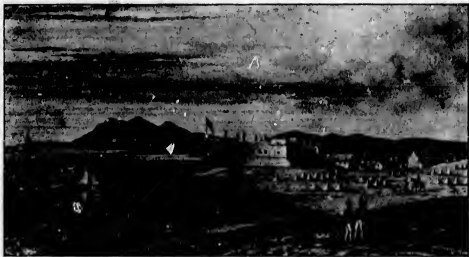
FORT AT CHAMBLY AND VIEW OF CAMP, 1814.

are dotted about here, and in the fall these islands are a favorite ground for duck-hunting. Above these islands we come to Vaughan's Ferry—the old Montreal and Boston team route—now disused since the building of the Richelieu bridge. (The battle between the Eagle and Growler and the British gun-boats took place right here, and in the house on the left bank of the river General Hull stayed over night when on his way from Montreal to the "lines" to be exchanged.) Hospital Island is now passed, and various handsome summer residences stand on the banks of the river showing how the beauties of this river are appreciated.