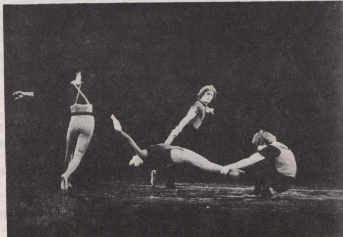
Entre-Six interprets Benjamin Britten's Toccata.