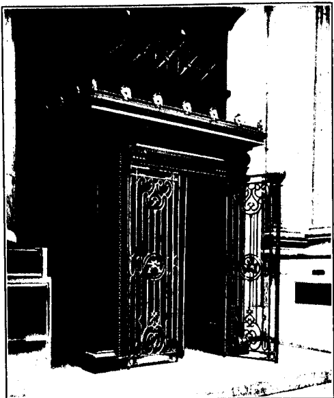
Entrance Doors Imperial Trust Co. of Canada Chadwick & Beckett, Architects

Some Products of our Ornamental Iron Department. Can These be Excelled?