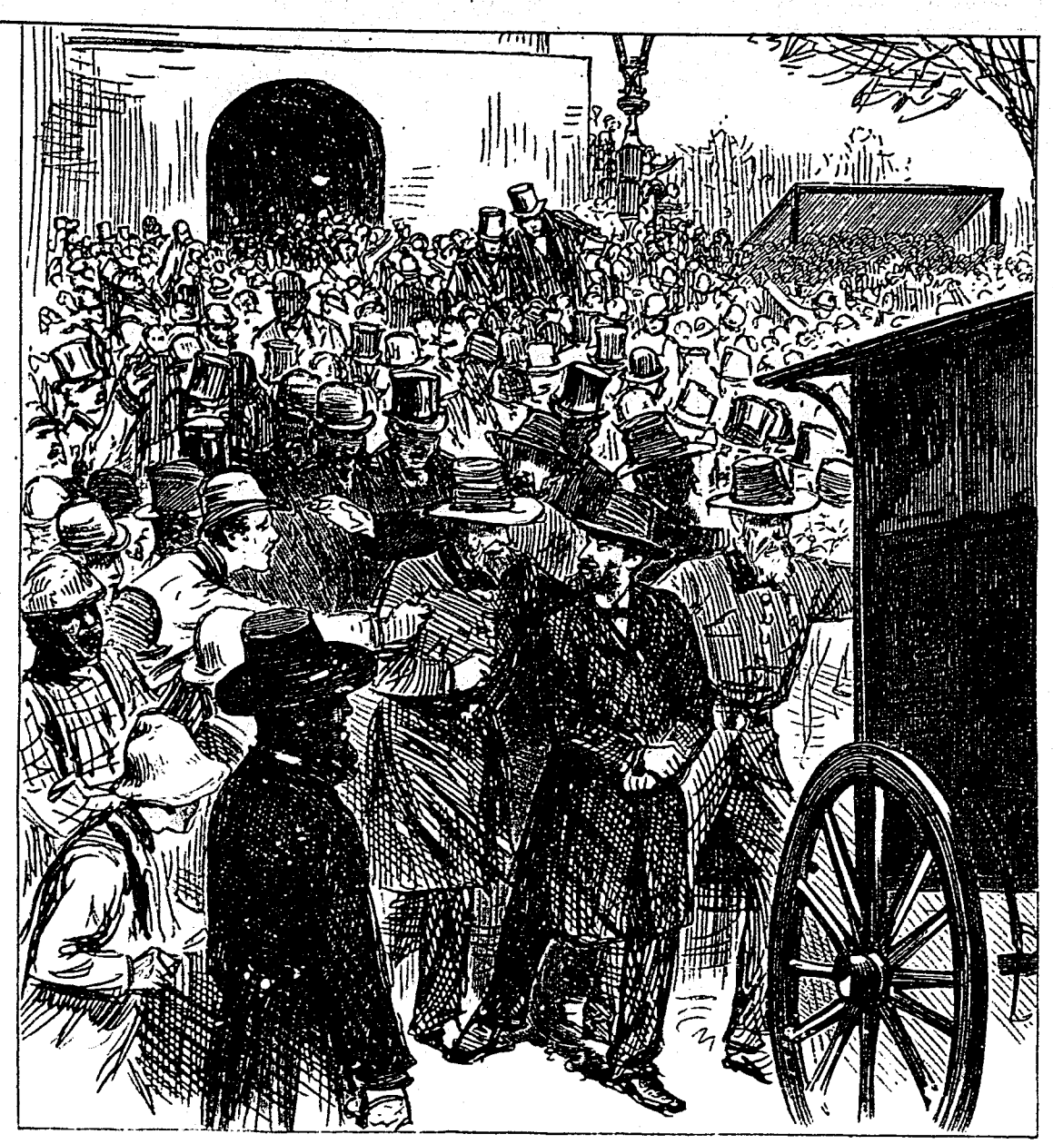
FROM THE COURT-HOUSE TO THE PRISON VAN, AFTER THE ADJOURNMENT ON MONDAY, NOVEMBER 14.