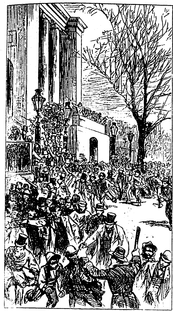
SCENES OUTSIDE OF THE COURT-HOUSE.