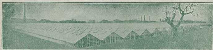
Conservatories of The Dale Estate, Brampton, Ont. Glass supplied by our Toronto Branch

GOOD QUALITY, FLAT, EVEN THICKNESS, AND WELL CUT