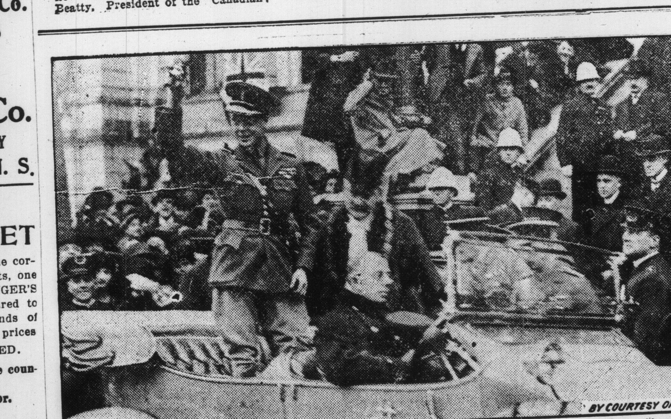
The Prince Greeted at the City Hall, Quebec.

For the last three years the new Arts building and the Grant Hall have been used as a hospital by the military authorities, and there has been abundant testimony to the satisfaction that the patients have felt in being housed so well amid such beautiful surroundings. The soldier patients are now transferred elsewhere, releasing the class room space for the growing requirements of the University.