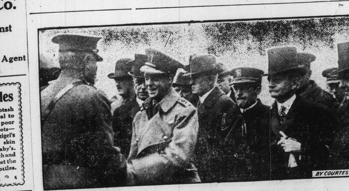
General Pershing Greeted the Prince at U. S. National Capitol