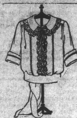
Ladies White Voile and Organdie Blouses.

We have so many Good Things for you that we cannot begin to give them all special mention. The items shown on this page are merely some of our most Timely Values, but to get the full benefit of our better Values you should come in and inspect our Goods.