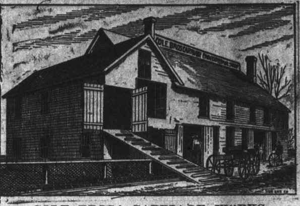
COLE BROS.' CARRIAGE WORKS.