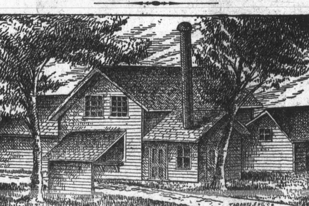
GLEN BUELL CHEESE FACTORY