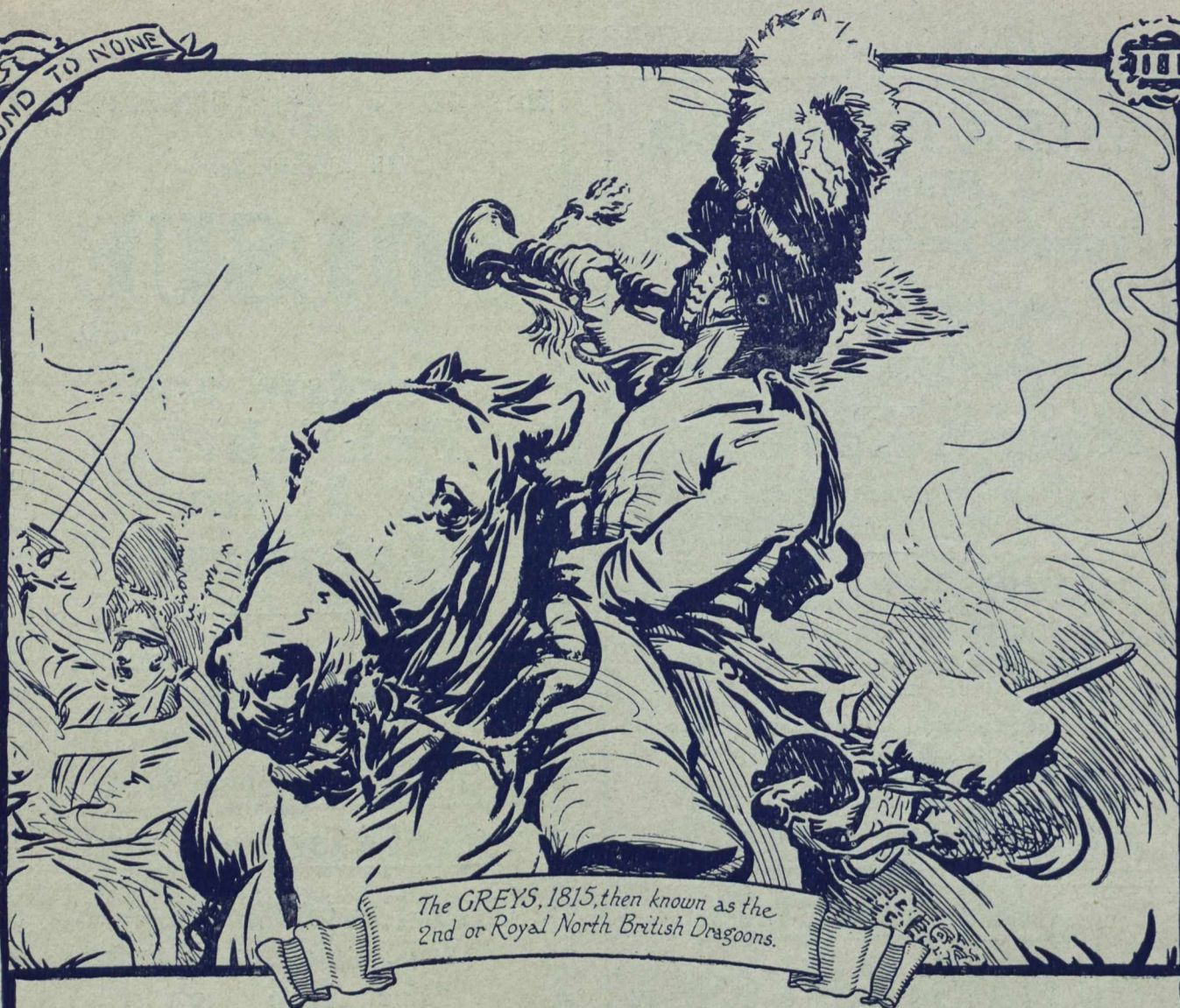
The GREYS, 1815, then known as the 2nd or Royal North British Dragoons.

20 for 1/- 50 for 2/6 100 for 4/9 Of all High-Class Tobacconists and Stores.