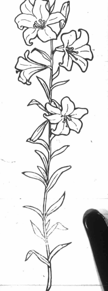
"He is not here; for He is risen, as He said." (St. Matt. 28: 6)