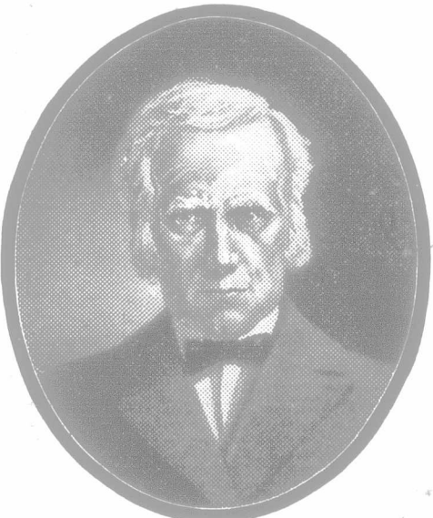
The Discoverer of the World's Greatest Remedy for Piles.

We want every pile sufferer to try Pyramid Pile Cure at our expense. The treatment which we send will bring immediate relief from the awful torture of itching, bleeding, burning, tantalizing piles. If they are followed up as directed we guarantee an entire cure.