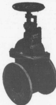
Indicator Gate Valve.

Railway Supplies, Structural and Ornamental Iron Work