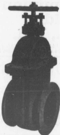
Flanged End Gate Valve with Hand-Wheel.